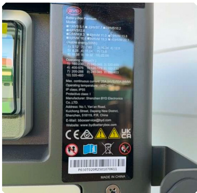
Master serial number