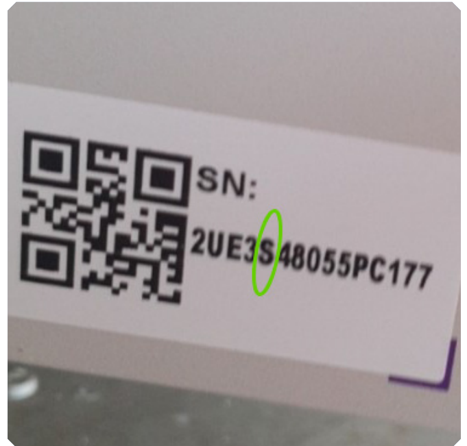
Module serial number