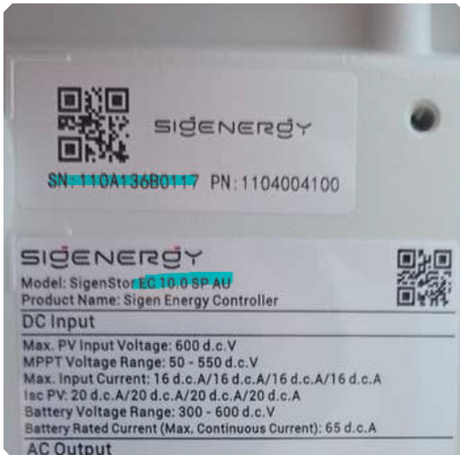
Master serial number