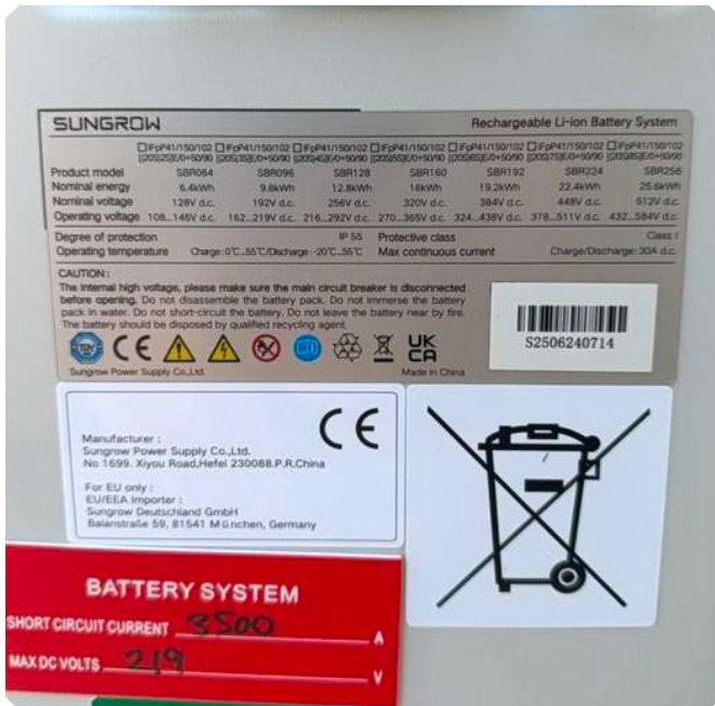
Master serial number