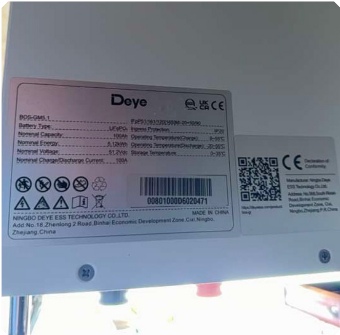
Module serial number