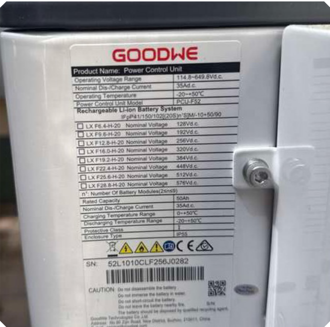
Master serial number