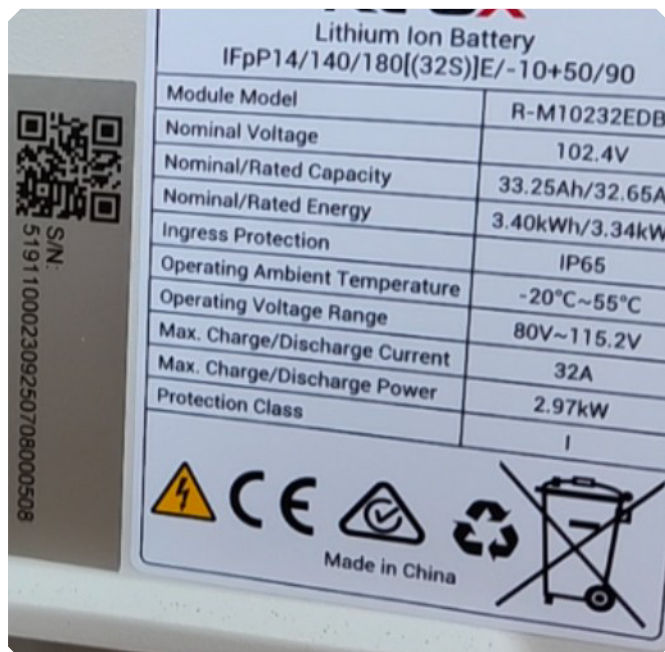
Module serial number