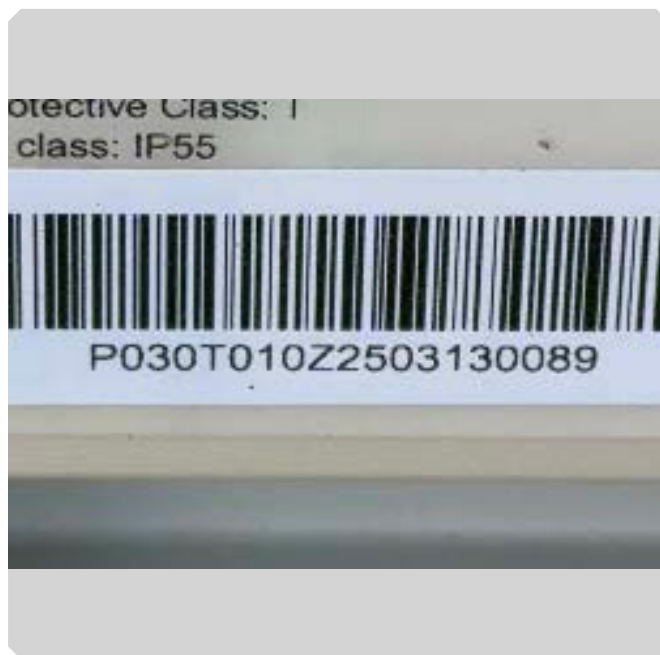
Module serial number