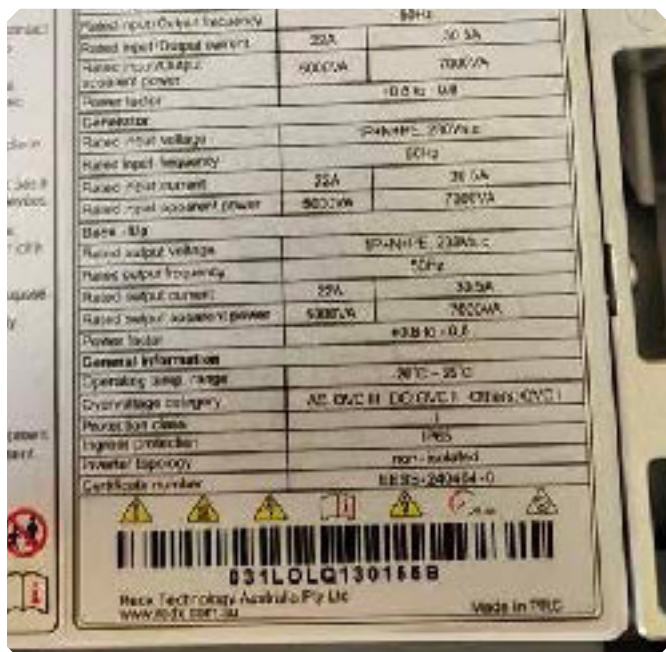
Master serial number