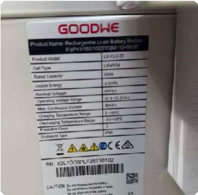
Module serial number