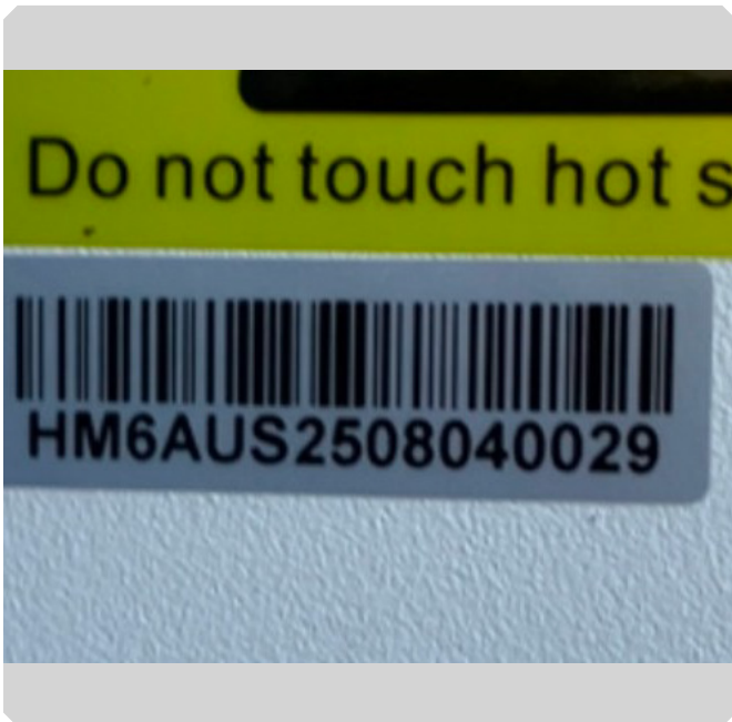
Master serial number