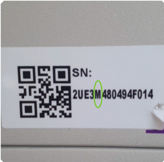
Master serial number