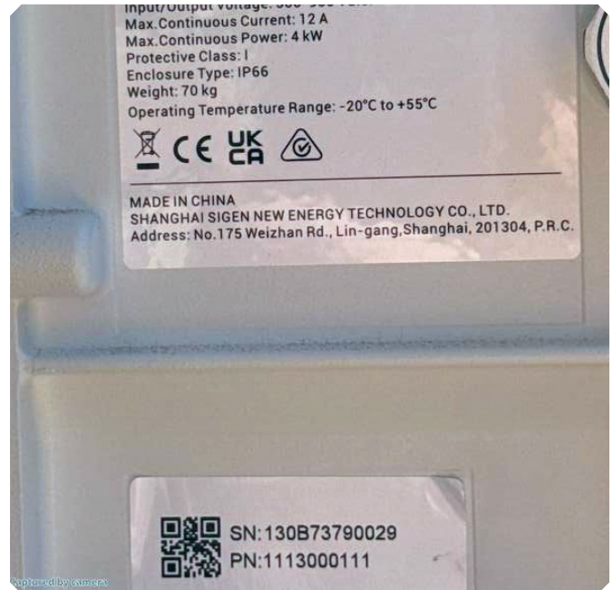
Module serial number