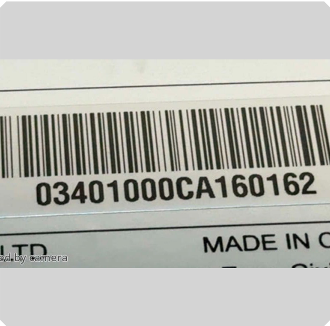
Master serial number