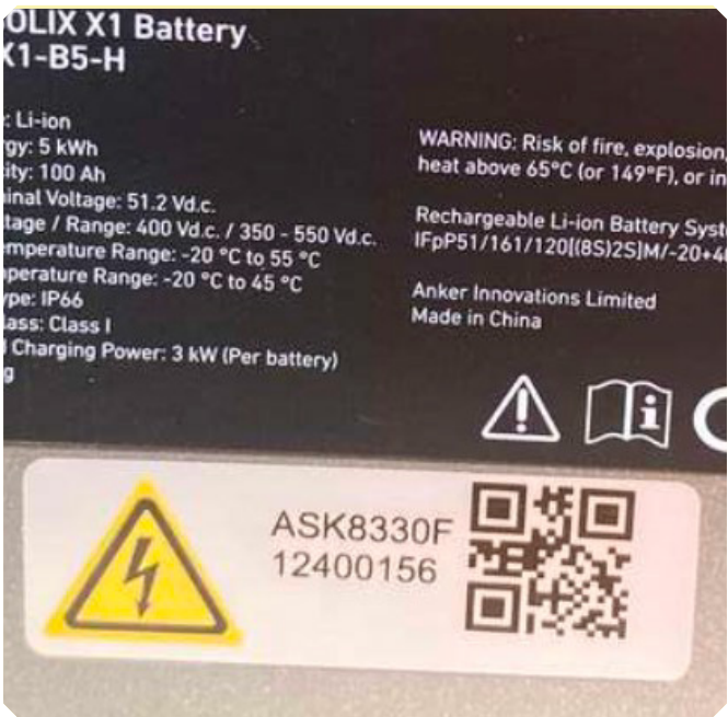
Module serial number

Master SN is located next to name plate, above switch