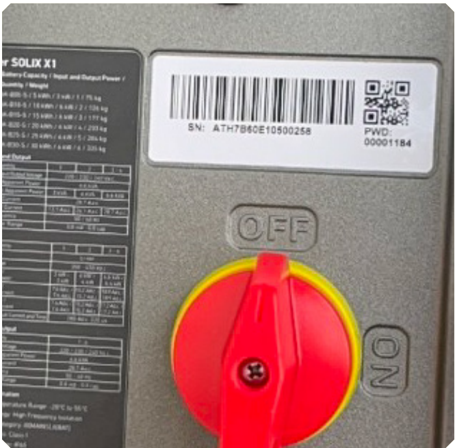
Master serial number