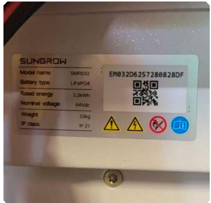
Module serial number