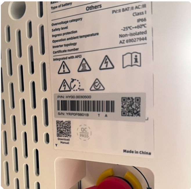
Master serial number