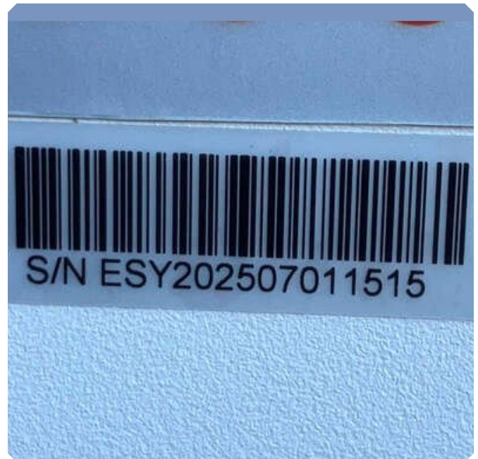
Module serial number