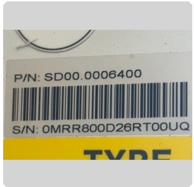
Module serial number